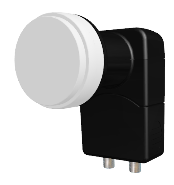
Click object to rotate